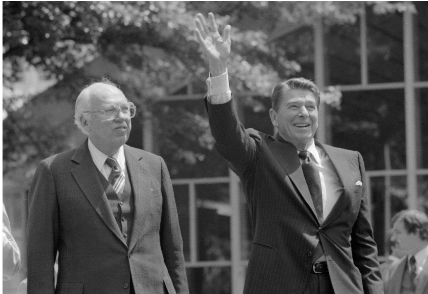
DCI William Casey and President Ronald Reagan addressed concerns that the executive order on intelligence activities issued during the previous administration was overly restrictive.

Fulfilling a campaign promise to revitalize America’s intelligence capabilities, specifically in counterintelligence (CI) and technical collection required to assess more accurately the military strength of the Soviet